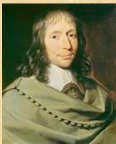
Blaise Pascal (1623-1662)

“There are only two kinds of men: the righteous, who believe themselves sinners; the rest, sinners who believe themselves righteous.”