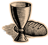
"Christ our Passover" I Corinthians 5:7